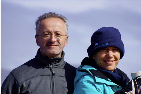
Andrew Denton & Jennifer Byrne

Andrew Denton is an award-winning writer, performer and producer. His TV programs include The Money or the Gun, Enough Rope, CNNNN (The Chaser), Hungry Beast, and The Gruen Transfer.